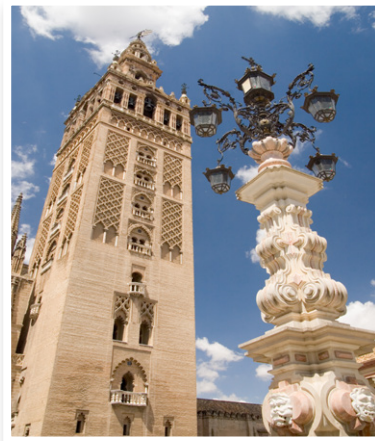
The Giralda, one of Sevilla's icons.

If you want to be fully immersed in Spanish culture, take advantage of the homestay option. You'll receive three meals a day and laundry service once a week. Alternatively, if a dorm-style living arrangement with other international students sounds more appealing, you can choose a residencia or a fully-furnished apartment.