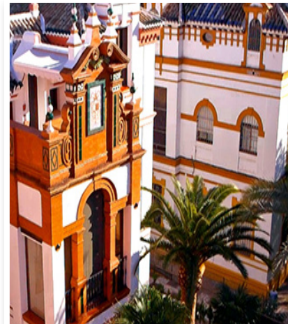
Vibrant architecture adorns the streets in this Spanish city.

The Sevilla program is offered during the fall or spring semesters for an affordable price. Included with each semester's cost, students will receive housing, health insurance, tuition and fees and an excursion that connects the courses to a hands-on exploration of the Spanish culture.