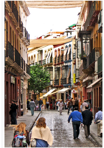
A colorful street in downtown Sevilla.

Interested in spending a semester in Sevilla? The deadline to apply for the 2018 spring semester is September 15, 2017.